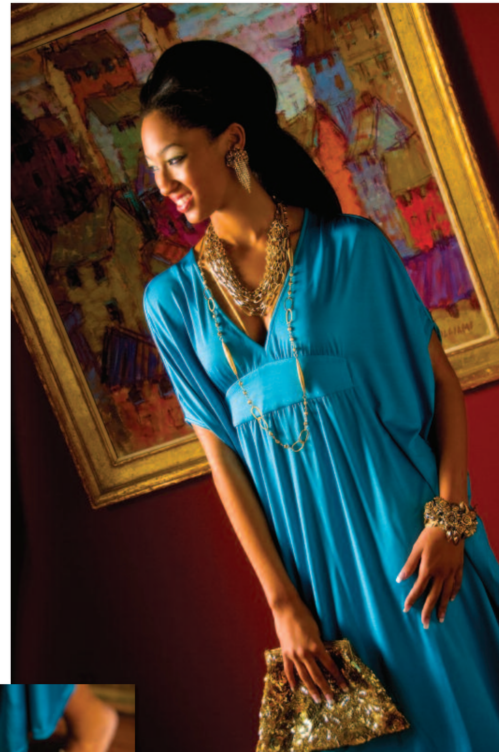
ABOVE - Slinky '60s pool party dress in turquoise available at SURFACE. Earrings, bracelet, necklaces and handbag stylist's own. Gold and rhinestone shoes from Doncaster.

LEFT - Black 100% silk pleated empire bodice camisole with silver chain straps and satin detail, 100% silk shrug, high waisted pencil skirt in wool, patent and leather opera gloves, black mules with rhinestone accents, tweed black and white chevron design coat with leather belt, all available from Doncaster. Black beaded evening bag, bracelet and earrings, stylist's own.